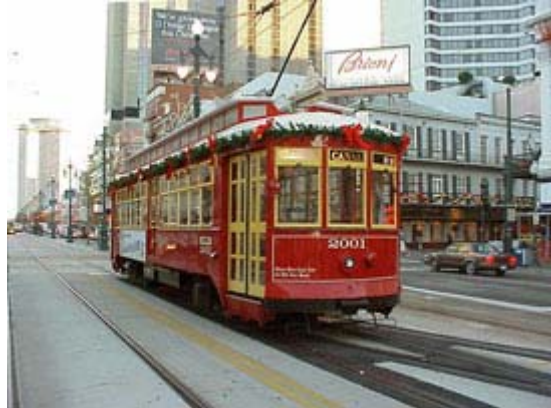
New Orleans: The Big Easy moves one step closer to full service!

Now, see, if we already had a streetcar, you could get to the meeting like this: